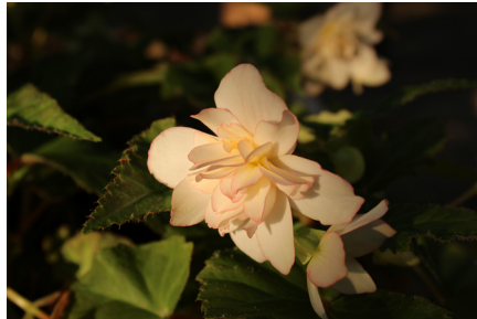
Wildflower